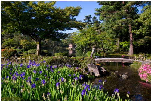
Kenrokuen Garden

The venue of Noh Night is a 5-minute walk from Kenrokuen Garden.